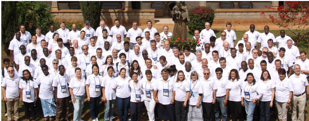
Nairobi - Kenya - Africa, on September 27, 2014.

Your brothers and sisters, New Marists in Mission,