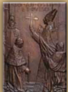
Opening the Holy Door