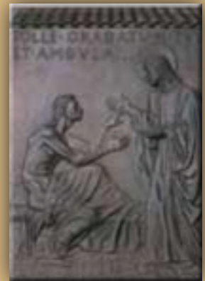
The Cure of a Paralytic