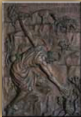
The Lost Sheep