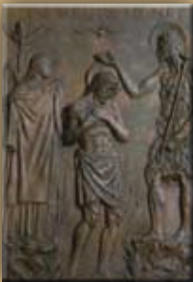
Christ's Baptism in the Jordan

2. Through Baptism, Jesus permits us to join his People; he comes to seek us when we stray from him, as the shepherd goes in search of his lost sheep; he awaits our return and welcomes us at the door, as the father welcomes the prodigal son; he cures those who are paralyzed by sin.