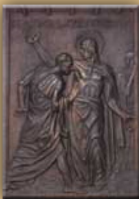
The Appearance to Thomas

4. Jesus unlocks the heart of doubting Thomas to the faith; he gives his Spirit to the Apostles to enable them to forgive sins; he tumbles Paul from his horse and suddenly opens up a whole new world to him; he knocks at everyone's door and waits for us to open it.