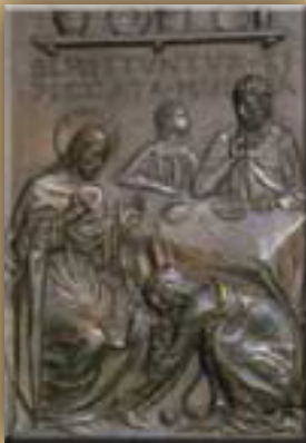
The Woman who was a Sinner

3. Jesus opens the door of new life to the woman who is sinful but can love; Jesus tells Peter that one must forgive seventy times seven times. Jesus trusts anew in the man who promises fidelity and then denies him; Jesus opens the door of heaven to the thief who calls on him.