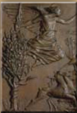
The Angel at the Gates of Paradise

1. Through disobedience Adam and Eve turned away from God and happiness and were chased from the garden; Mary receives the announcement of salvation from the angel and directs humanity back to God.