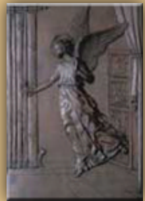
The Angel of the Annunciation

2. Through Baptism, Jesus permits us to join his People; he comes to seek us when we stray from him, as the shepherd goes in search of his lost sheep; he awaits our return and welcomes us at the door, as the father welcomes the prodigal son; he cures those who are paralyzed by sin.