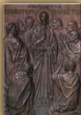
Christ's Appearance to The Disciples