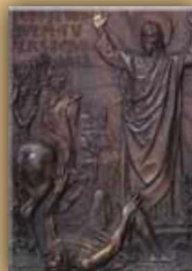
The Conversion of Saul