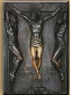
In Front of the Crucifix The Good Thief

4. Jesus unlocks the heart of doubting Thomas to the faith; he gives his Spirit to the Apostles to enable them to forgive sins; he tumbles Paul from his horse and suddenly opens up a whole new world to him; he knocks at everyone's door and waits for us to open it.