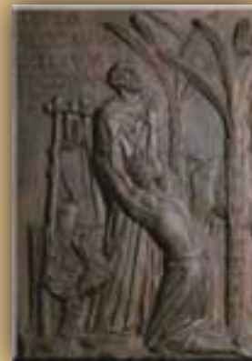
The Merciful Father