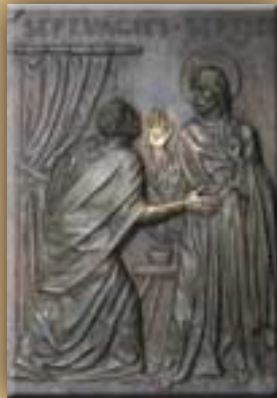
The Need for Forgiveness