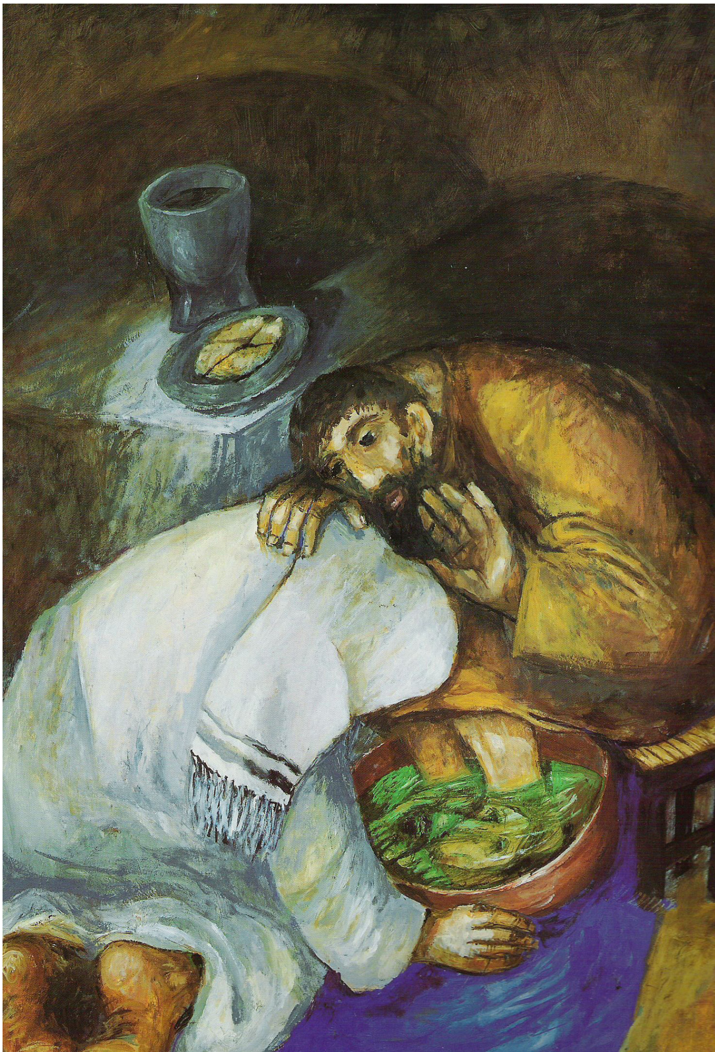
The Washing of Feet by Sieger Koder