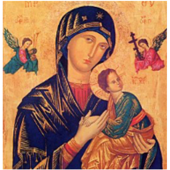
Icon of Our Lady of Perpetual Help (Succour) CRETAN SCHOOL, BEFORE 1499

What has the icon to say to us in the turmoil of today? In it, we see a Jesus who is fearful; his face is unsure, concerned. He's turning towards one of the angels, and he's realising in that moment that doing the will of his father is going to involve suffering. Both his hands are clutching his mother; he knows she will look after him, that she is the person he mustn't let go.